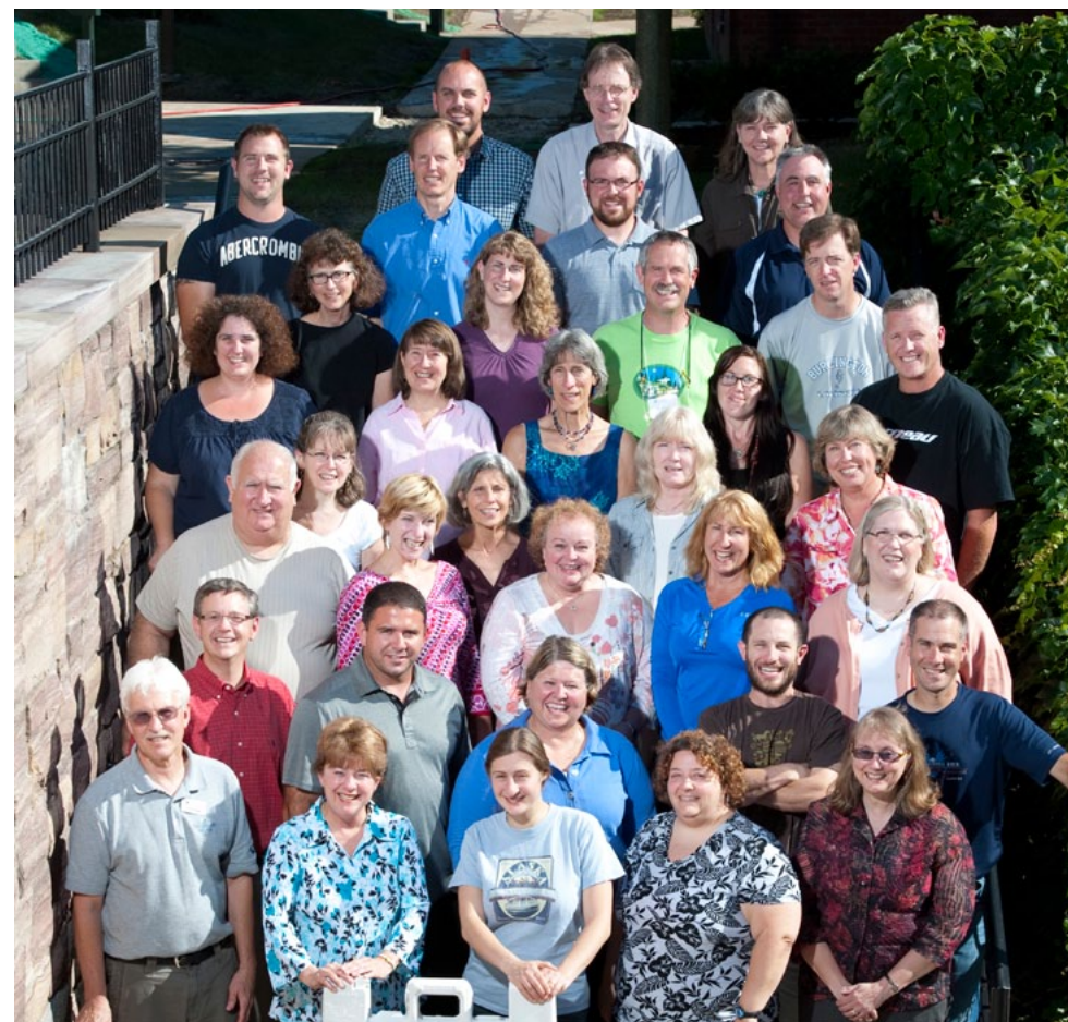
Summer Institute Class of 2012

Participants also learned games to promote financial literacy, and left with a $400 toolkit of classroom-ready curricular materials. The 26 instructors included nationally known experts. With 32 middle school and high school teachers, enrollment was up by one-third compared with 2011. Teachers from about half of Vermont's school districts have participated in the first two institutes, so students statewide are benefitting from their