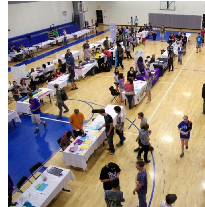
Students at the Game of Life Program