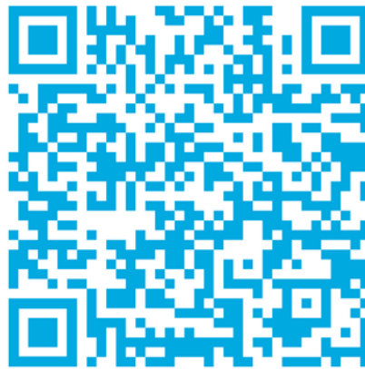
Title IX & Sexual Misconduct Reporting Form