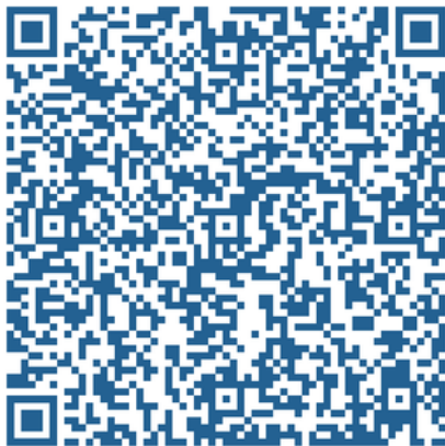
Title IX & Sexual Misconduct Website Info

Steps specific to the voluntary Informal Resolution Process